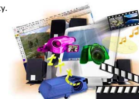
Have fun while learning with multimedia

Operation MALEE (Multimedia Assisted Learning Effective English) is a KU-Wide HRD program on Effective English Communication, a self learning which will assist us to enhance our English skills by using multimedia.