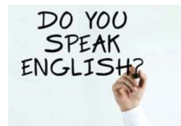
Have you ever wondered how important the English language is in our lives?