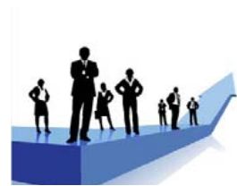
There is no other way but up!

Grab this chance and be part of Operation MALEE